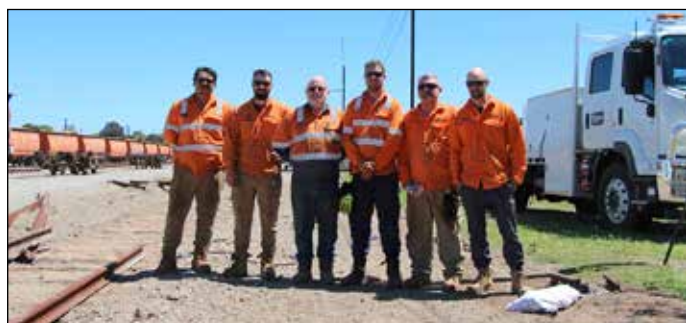
Above: The One Rail track crew. See below for names*.

Port Lincoln Crane Service then lifted the traction bogies for 850 across to the shed track for us (the loco is currently sitting on temporary workshops bogies). The bogies for 850 and for the hopper wagon are now in place ready for the "big move".