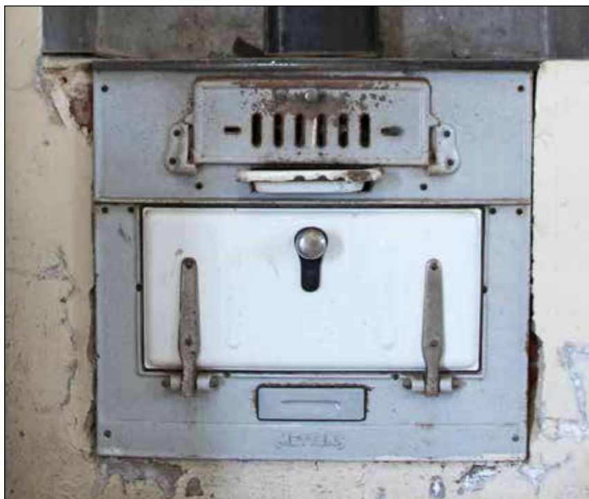
Above: The Metters stove in the crew room at Port Lincoln.

Tucked away in one of the buildings in the museum precinct is an intact example of these classic stoves. The Porters' Room and Yardmaster's Hut stove is a Metters No.2 New Royal style which was bought new by the South Australian Railways in 1913. It has quite a history!