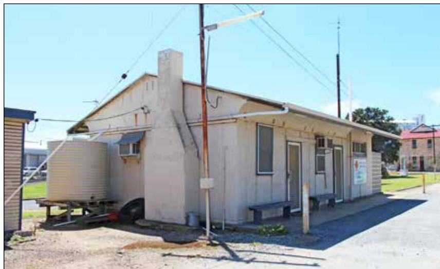
Left: The former crew amenities and Yardmaster's hut at Port Lincoln. Note the brick chimney housing the stove. The chimney and stove date from 1913 in Kimba, and were relocated here in 1934.

The museum plans on using this building as an additional display area once the 850-HAN shed is complete. This will allow visitors to see a prime example of a 1913 Metters stove still where it has been since 1964.