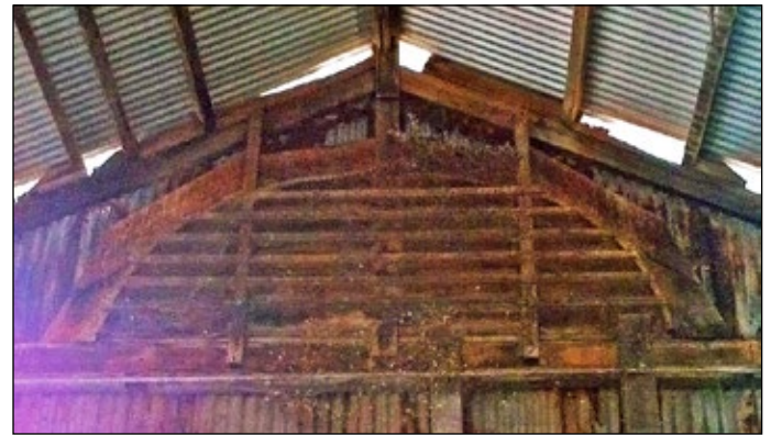
Above: The louvred vent which was saved for the museum.

Thanks to the cooperation of GWA and Macmahon Services, the Museum was able to recover one of the arched wooden louvred vents from above the doors. These were typical of SAR architecture in the 1880s (other sheds on Eyre Peninsula were built with rectangular style vents). It will now serve as the last tangible link to the beginnings of the Eyre Peninsula lines.