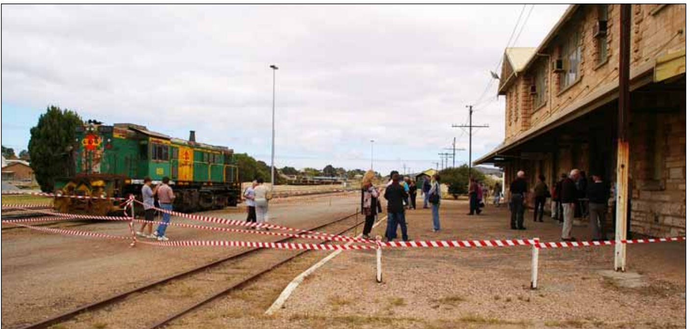
Below: Some of the crowd on the day.